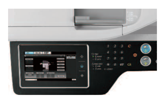
High-resolution touch screen with Stylus pen for easy point-and-touch operation