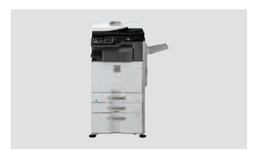
Available paper capacity stores up to a maximum of 3,100 sheets with options