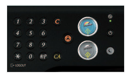
Separate print buttons for B&W and Color allow users to selectively manage use of color