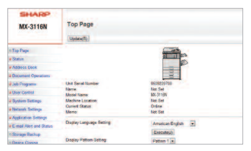
Embedded web page