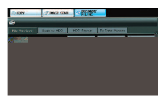
Sharp's easy-to-use Document Filing System with thumbnail preview